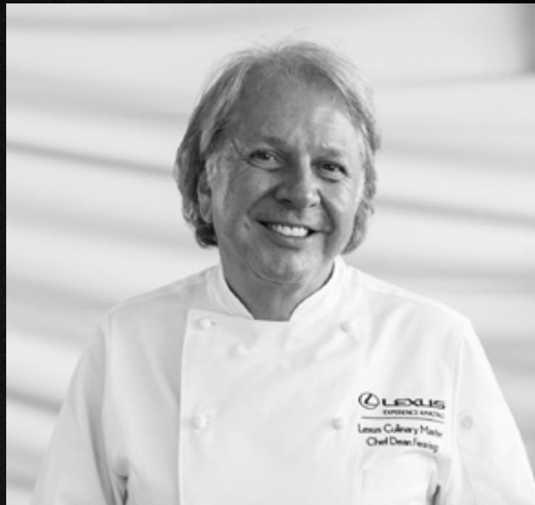
Chef Dean Fearing