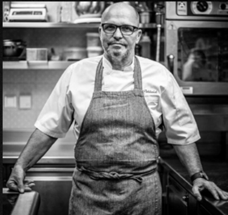
Chef Zdeněk Pohlreich